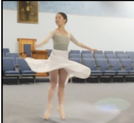
Induction Dance company, founded by the son of one of our members, provided entertainment. Here, the company's ballerina en pointe

August brought our big Chapter fundraiser and Members Night. Our “Christmas in August” event included a full holiday dinner; boutique items handmade by Chapter members; silent auction baskets including things for the garden, natural beauty, spirits, home baked goods, and quilt art. There was also a long-awaited dress sale; and entertainment by a new dance company in town that was founded by the son of one of our Chapter members. The evening was a great success because of the hard work of so many members and all of the guests who purchased tickets and shopped. Celebrating members seems like a natural follow-up to such a huge effort, and our Chapter’s annual Members Dinner did just that. Our Worthy Matron and Worthy Patron kept in mind the diverse dietary needs of Chapter members and cooked/baked foods for everyone. After dinner, we celebrated some wonderful Chapter members who earned the Eastern Star Service Award.