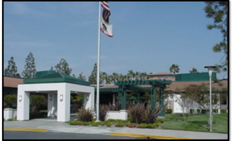
SENIOR LIVING COMMUNITY 16850 BASTANCHURY ROAD YORBA LINDA, CA 92886

As I sit at my keyboard trying to figure out what the membership of California would like to know about our beautiful facility, I am surprised with the knowledge that some of you have never been to this wonderful building! So first, let me take this opportunity to extend a sincere invitation to come visit us! We would love to show you some of our Senior Living Community hospitality. As the Covid clouds begin to part, we are starting to join the outside world and all the activities that our area has to offer. Although we are still very cautious, we, along with the rest of society are feeling a little more comfortable venturing out. We must thank the awesome members of our staff, current and former, for their due diligence in keeping our residents safe and COVID-FREE during this pandemic, a truly awe-inspiring achievement!