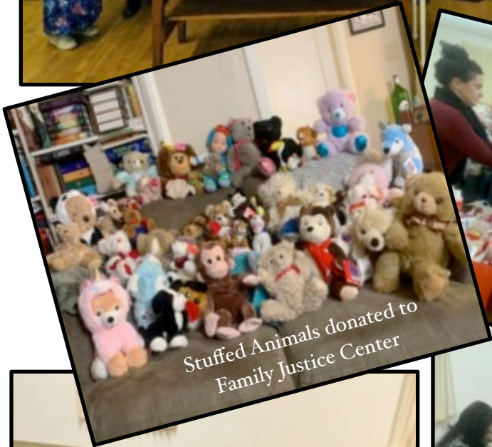
Stuffed Animals donated to Family Justice Center