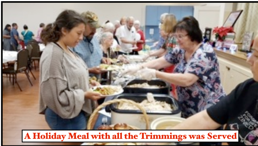
A Holiday Meal with all the Trimmings was Served

August brought our big Chapter fundraiser and Members Night. Our “Christmas in August” event included a full holiday dinner; boutique items handmade by Chapter members; silent auction baskets including things for the garden, natural beauty, spirits, home baked goods, and quilt art. There was also a long-awaited dress sale; and entertainment by a new dance company in town that was founded by the son of one of our Chapter members. The evening was a great success because of the hard work of so many members and all of the guests who purchased tickets and shopped. Celebrating members seems like a natural follow-up to such a huge effort, and our Chapter’s annual Members Dinner did just that. Our Worthy Matron and Worthy Patron kept in mind the diverse dietary needs of Chapter members and cooked/baked foods for everyone. After dinner, we celebrated some wonderful Chapter members who earned the Eastern Star Service Award.