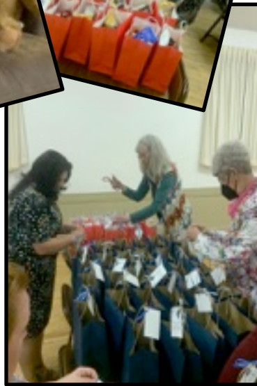
Goodie Gift Bags for First Responders