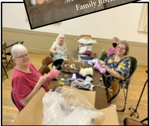
Members Sewing for Patient Comfort Station